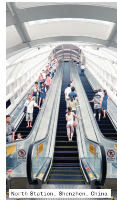
North Station, Shenzhen, China

"Stand on the right, walk on the left" actually slows down passenger flow. Studies show that escalator capacity increases by about 30% if nobody walks. At TK Elevator, we know the escalator business like the back of our hand and it's this expertise that makes our new velino series so special.